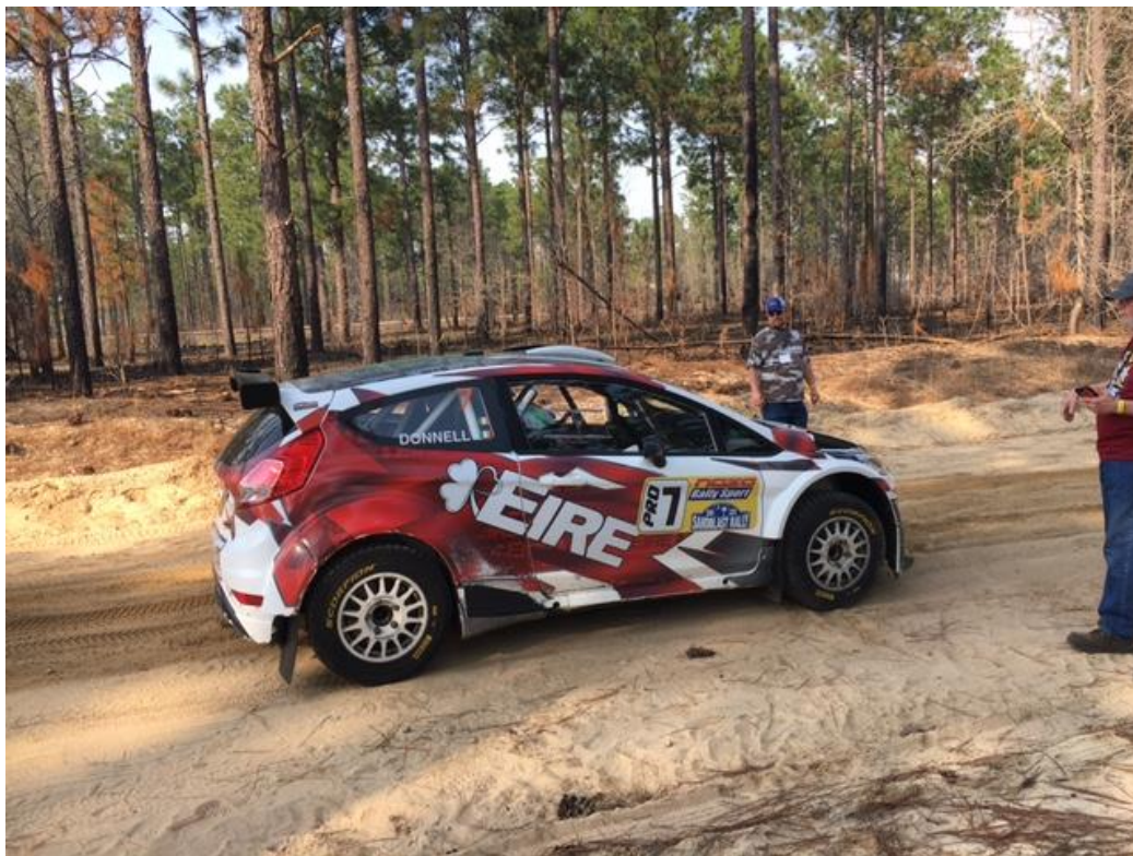
Car at start line , 2 non radio volunteers check for helmets, seatbelts and wristbands indicating they are part of the Rally..

SHAKEDOWN runs like this, vehicles leave in one minute intervals, the start radio op calls out their number. Finish and halfway record the number and check it off when they go by, no times are recorded. Non radio volunteers handle the actual start and pre-start activity. First we ran motorcycles; we waited until the last motorcycle cleared finish then verified that all who started finished, then we ran cars. After the last car, we again verified all had finished before running the motorcycles that had circled around to restart. This continued until 1800, toward the end only cars were left and some would pull up to the line only to start 30 seconds later the repeat.