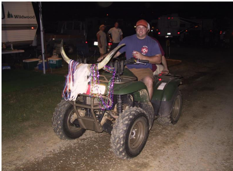
This was campground transportation until they required them to be street legal. Then we stopped going. At night they would pull a flatbed trailer with folding chairs and coolers to tour the campground.