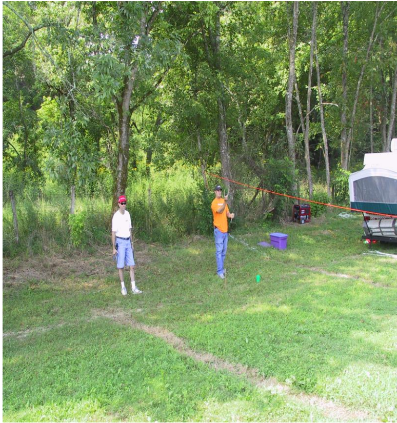
We brought “shoes” that year