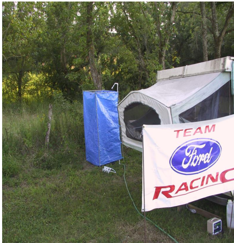
Our shower was a big hit, Thanks to the PEPSI man at FOOD CITY for the plastic base I still have in 2020.