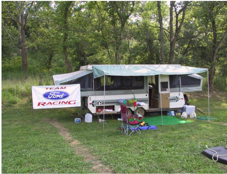
Narrow sites again in 05.