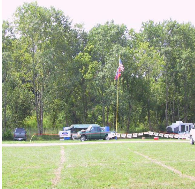
It would fill up by Sat night.

12V pump from 50gal drum in back of truck, heat up all day and took warm showers at night.