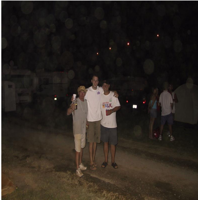
We would see these guys for many years later