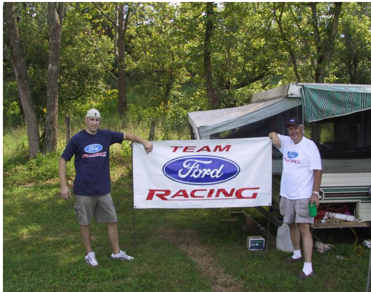
Last Year for the Jayco would be 07